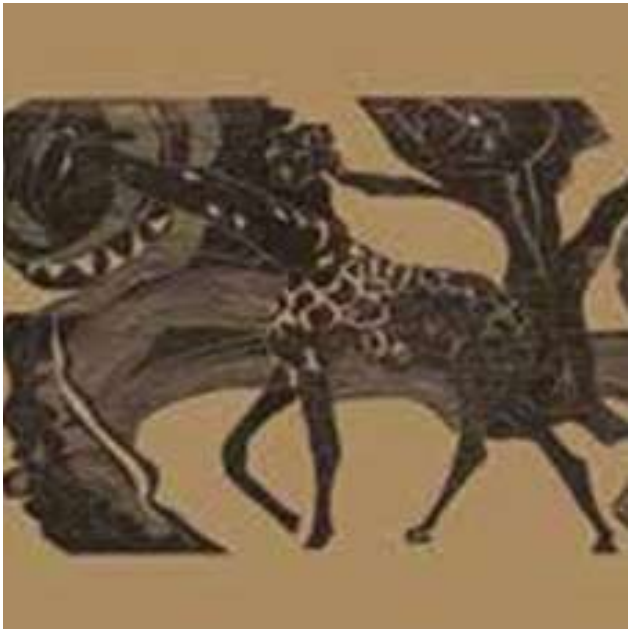
ROSWITHA VONGLEHN TITLE: BETWEEN SUN AND MOON MEDIUM: WOODCUT