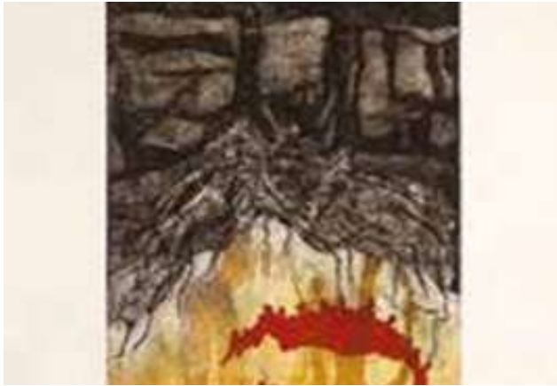
TITIA BALLOT TITLE: NIGHT OF THE SHAMANS MEDIUM: ETCHING