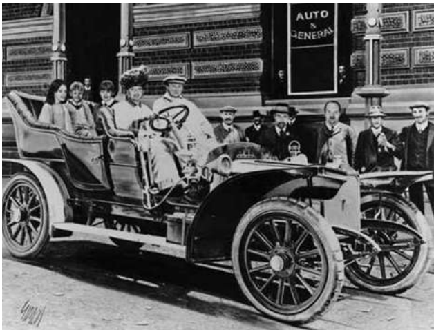
DOUW STEYN'S FAMILY IN FRONT OF THE AUTO & GENERAL BUILDING IN MELVILLE, JOHANNESBURG MEDIUM: GRAPHITE