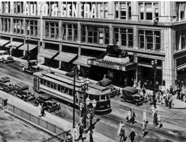
ORIGINAL AUTO & GENERAL BUILDING IN MELVILLE, JOHANNESBURG MEDIUM: GRAPHITE