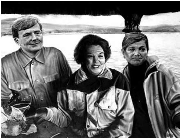
ROYAL PARTY OF THE NETHERLANDS MEDIUM: GRAPHITE