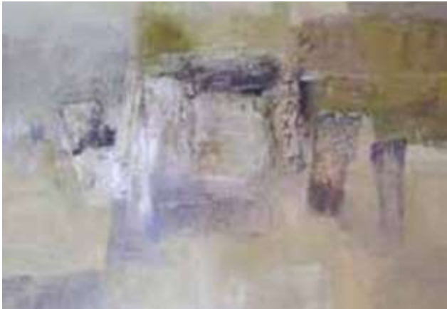
FIONA ROWETT MEDIUM: OILS ON CANVAS