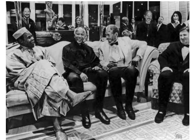
OFFICIAL OPENING OF THE SAXON HOTEL MEDIUM: GRAPHITE