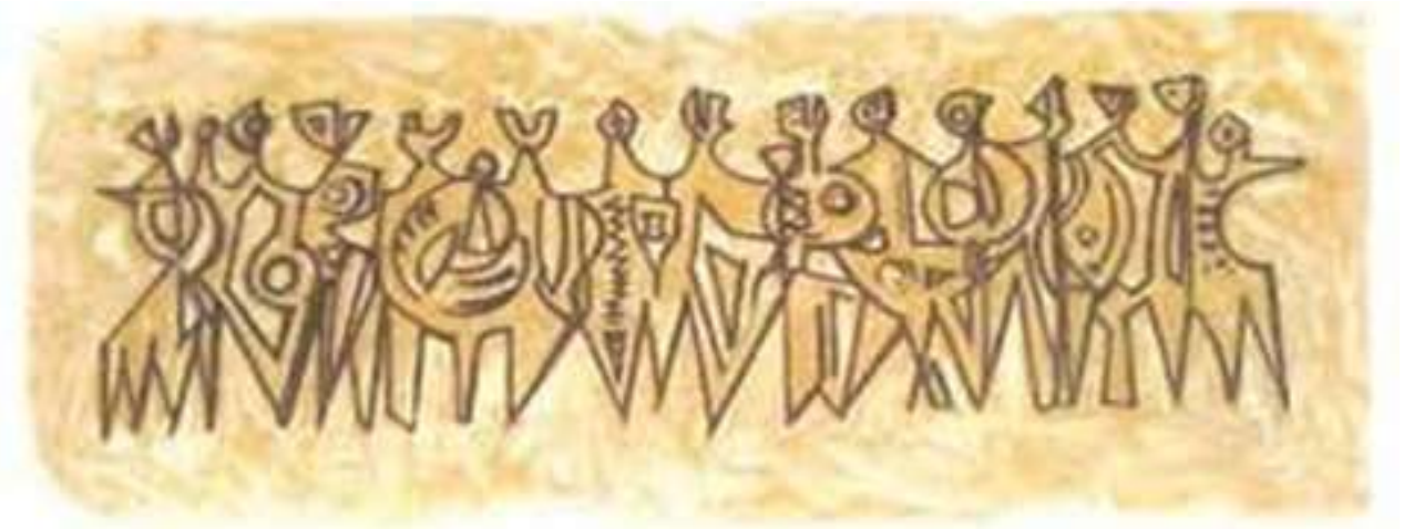
DIRK MEERKOTTER TITLE: VOTING DAY -1994 MEDIUM: ETCHING