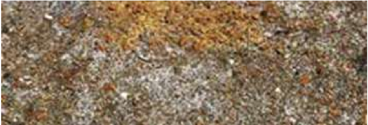
ERROL WESTOLL TITLE: PEBBLES MEDIUM: PHOTO-IMAGES