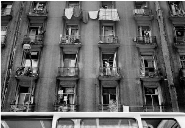
KUTLWANO MOAGI THE FIFTH FLOOR 2015 THE SPIER COLLECTION