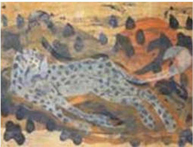
BEVERLEY WATSON MEDIUM: MONOTYPE