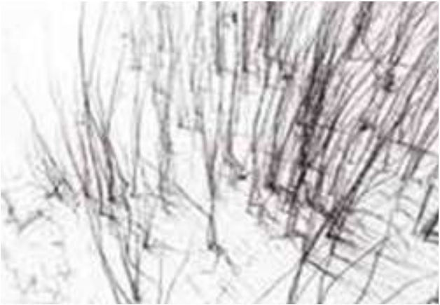
ERROL WESTOLL TITLE: DUNE GRASS MEDIUM: PHOTO-IMAGES