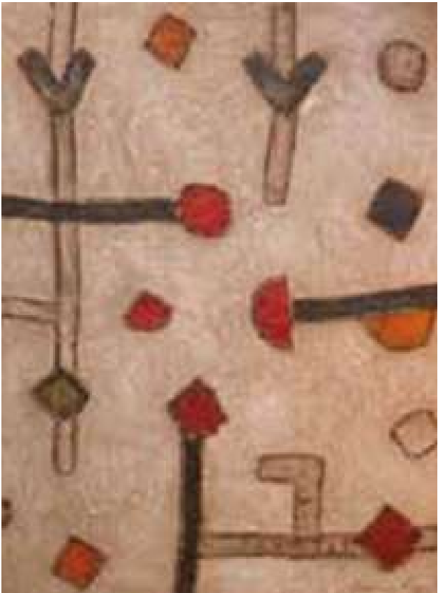
HANNES HARRS HANNES HARRS MEDIUM: TEXTILE COLLAGE ON CANVAS