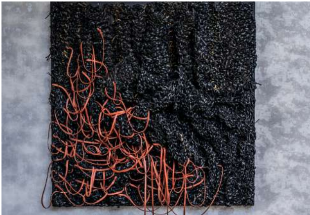
PATRICK BONGOY UNTITLED 2018 THE HUB COLLECTION