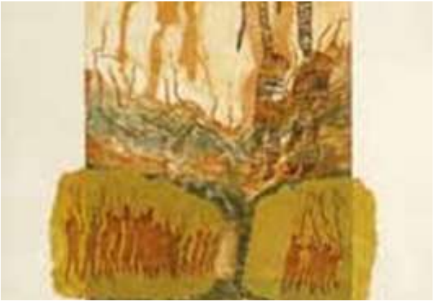
TITIA BALLOT TITLE: THE PROCESSION MEDIUM: ETCHING