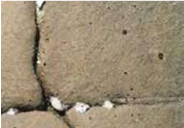
ERROL WESTOLL TITLE: RYNIE ROCKS MEDIUM: PHOTO-IMAGES