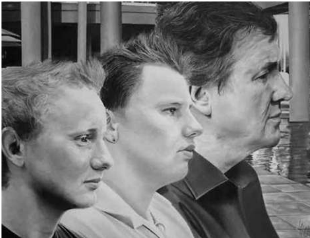
FATHER AND SONS MEDIUM: GRAPHITE