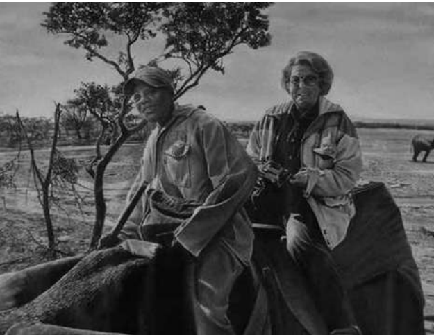
HM QUEEN BEATRIX MEDIUM: GRAPHITE