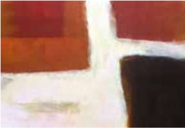
MARCEL GREYLING MEDIUM: ACRYLIC ON BOARD