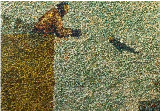
AKHOSANDILE MBUKU IN COLLABORATION WITH THE HUB MOSAIC STUDIO UNTITLED 2015 THE HUB COLLECTION