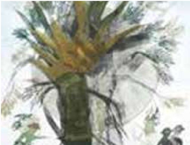
BEVERLEY WATSON MEDIUM: MONOTYPE