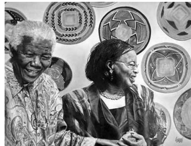
NELSON MANDELA AND GRAÇA MACHEL MEDIUM: GRAPHITE