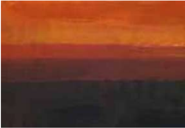
MARCEL GREYLING MEDIUM: ACRYLIC ON BOARD