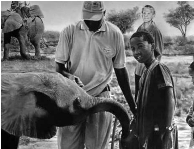
MADIBA THE ELEPHANT MEDIUM: GRAPHITE