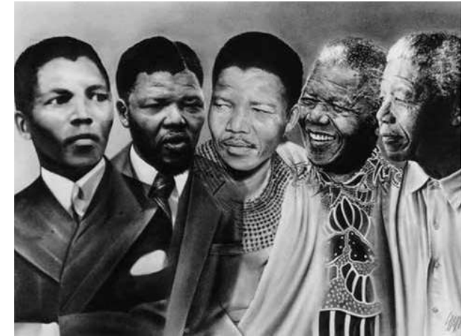
FROM FORESIGHT TO HINDSIGHT MEDIUM: GRAPHITE