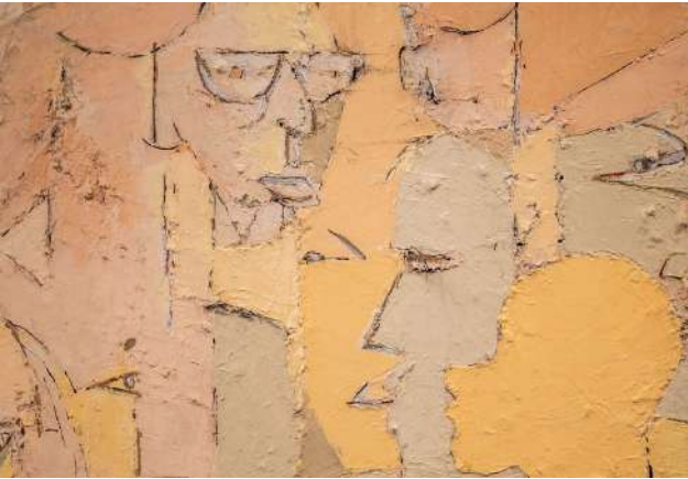
KAGISO PATRICK MAUTLOA UNTITLED 2007 THE SPIER COLLECTION