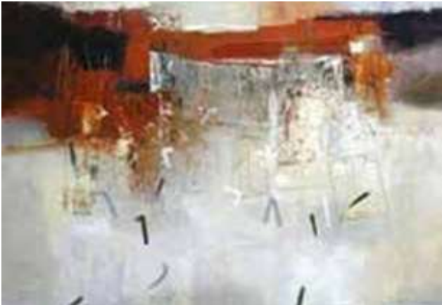
FIONA ROWETT MEDIUM: OILS ON CANVAS