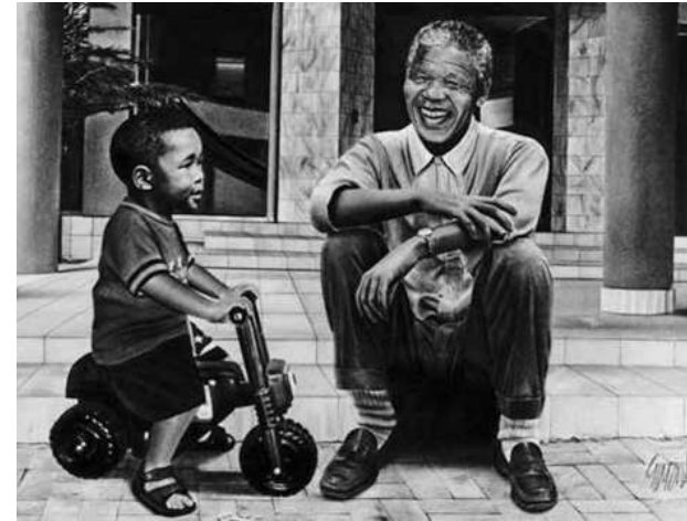
NELSON MANDELA AND GRANDSON MEDIUM: GRAPHITE