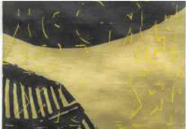
CAMERON PLATTER PIG DIG 2014 THE SPIER COLLECTION