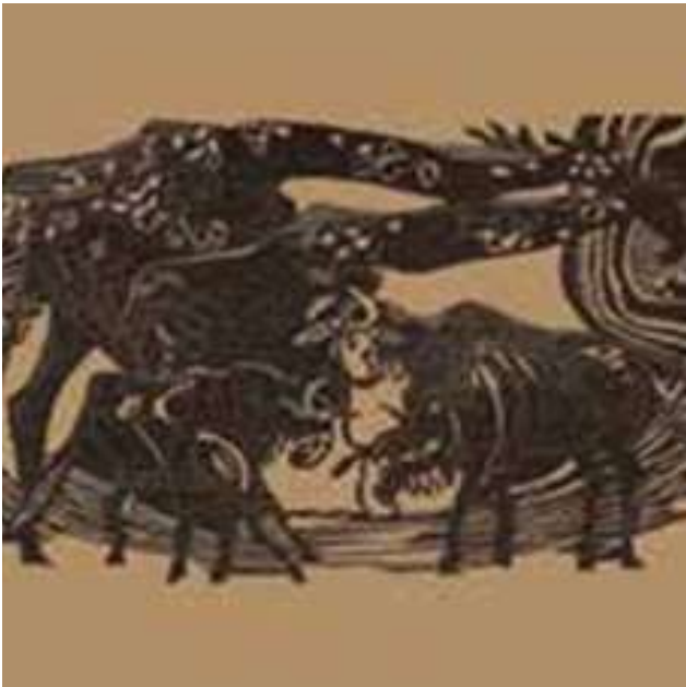
OSWITHA VON GLEHN TITLE: THE WATERHOLE MEDIUM: WOODCUT