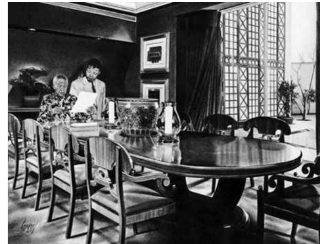
THE GREEN ROOM MEDIUM: GRAPHITE