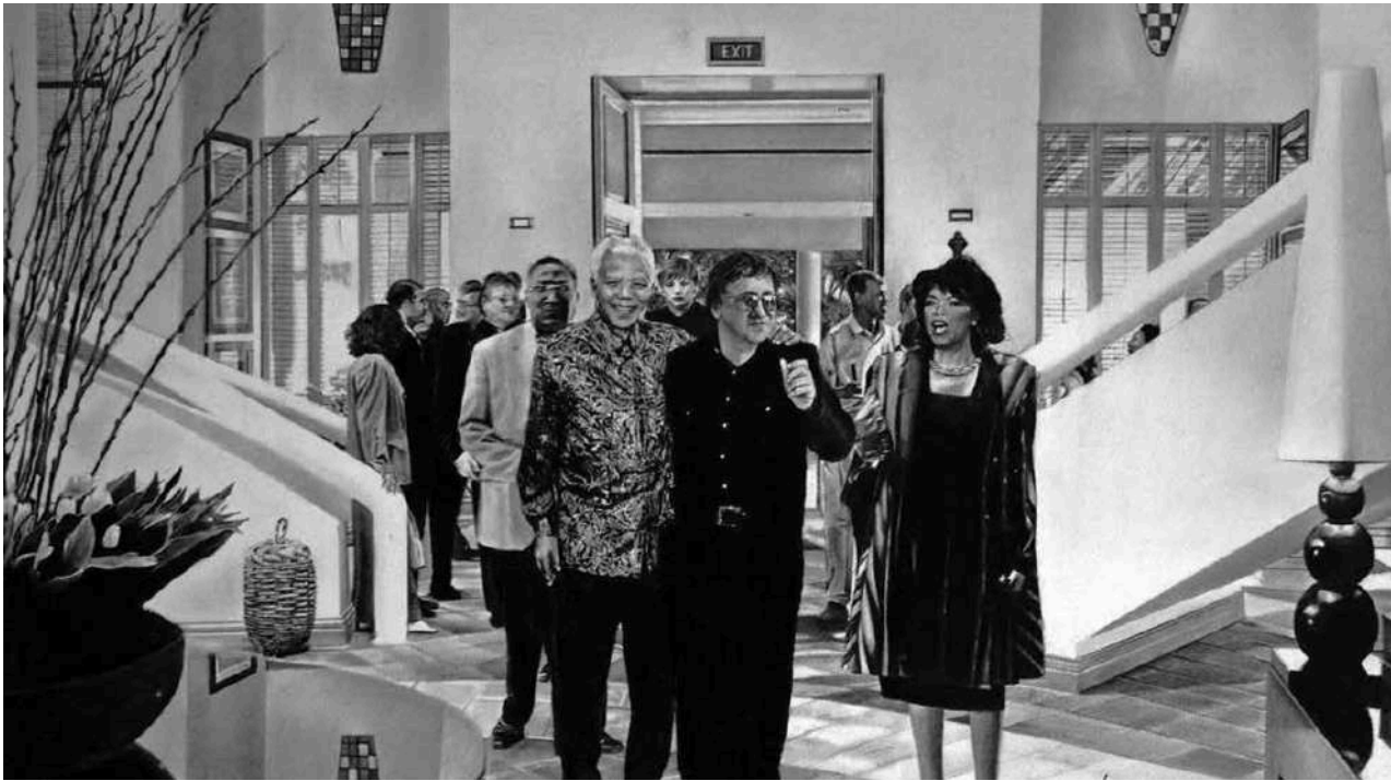
MEETING OF NELSON MANDELA AND OPRAH WINFREY MEDIUM: GRAPHITE