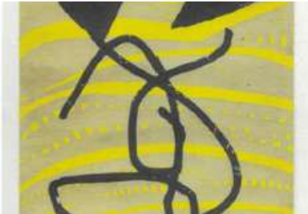
CAMERON PLATTER STAIN (MINE) 2014 THE SPIER COLLECTION