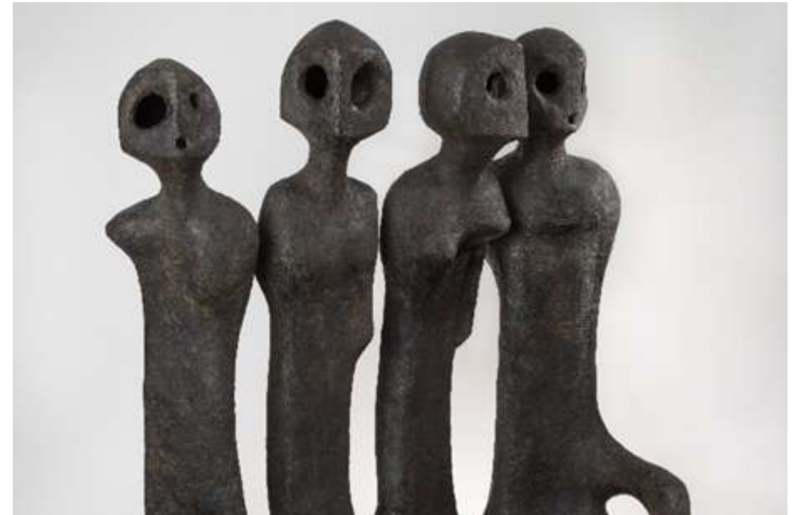
SPEELMAN MAHLANGU FOUR FIGURES (LIFE-SIZE) 2018 EVERARD READ