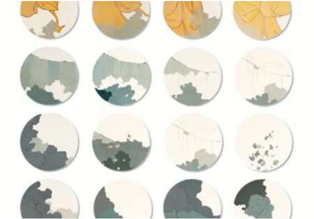
BONITA ALICE TREACHERY, LIES AND LAMENTATIONS 2011 THE SPIER COLLECTION