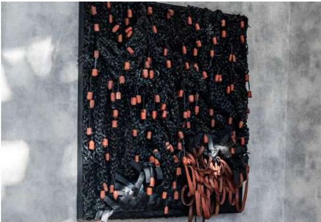
PATRICK BONGOY UNTITLED 2018 THE HUB COLLECTION